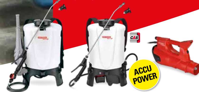
Backpack sprayer RPD 15*