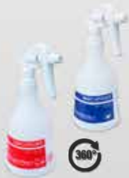
For disinfecting surfaces quickly by spraying and wiping Trigger sprayer McProper P/E and Desinfecta+