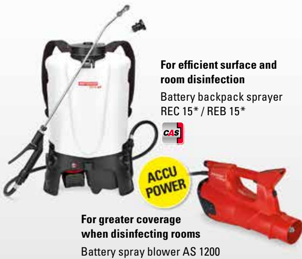
For efficient surface and room disinfection Battery backpack sprayer REC 15* / REB 15*

From trigger sprayers to backpack sprayers with batteries and additional spray blower – we are the experts when it comes to efficient, effortless room and surface disinfection.