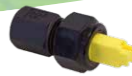
Anti-drift nozzle Art.No. 12009403