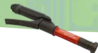
Vario Gun Art.No. 11558501