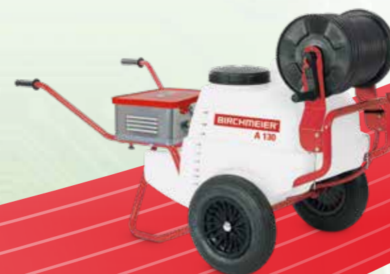
A 75 / A 130