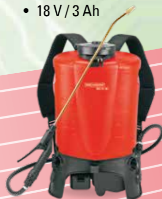
REC 15 REC 15 (Brass/Viton) REC 15 (Stainless steel/Viton)