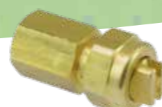
Fanjet nozzle Art.No. 11612810