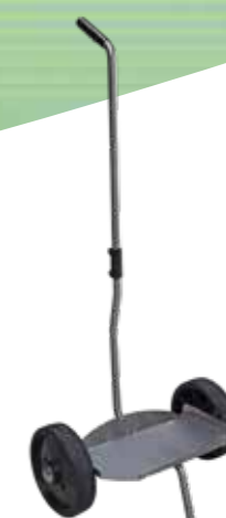
Stainless steel hand-cart H2 Art.No. 12022601