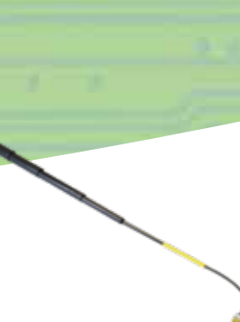
XL 8 S Telescopic lance (7 m) Art.No. 11935801