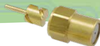
Duro-mist nozzle ø 1.5 mm Art.No. 28502324-SB