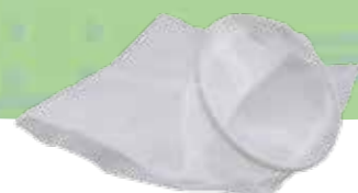
Bio filter bag Art.No. 11475701-SB