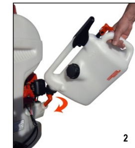
Fill up the tank by holding the can in vertical position (1). Sweep the can to empty the spout completely (2).