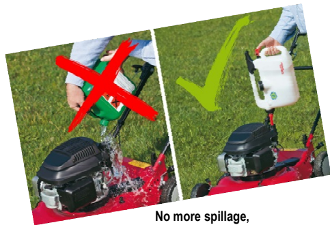
No more spillage, easy and clean fuelling