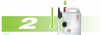
2 Fill up